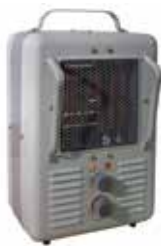
188 TASA $53.35