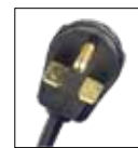
HF5848TC 30 AMP Plug NEMA #6-30P