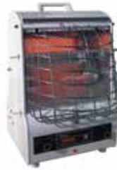
198 TMC $89.65