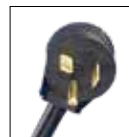
HF584TC 20 AMP Plug NEMA #6-20P

Heater: 10 5/8" x 11" x 9 5/8" Bracket: 2 1/2" x 10" x 14"