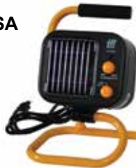
178 TMC $56.10