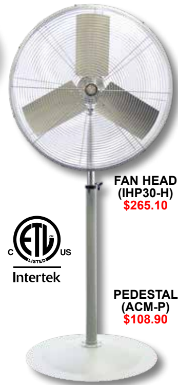
FAN HEAD (IHP30-H) $265.10

High performance 1/3 HP motor runs 15% - 18% cooler than standard 1/4 HP motors & allows fan to continue operating in air temperatures up to 135°F