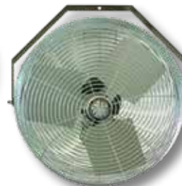
Totally Enclosed Motor Fans U-TE Series Gray grill & black yoke