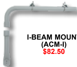
I-BEAM MOUNT (ACM-I) $82.50