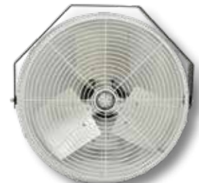
Corrosion Resistant Fans U-CR Series White grill & black yoke